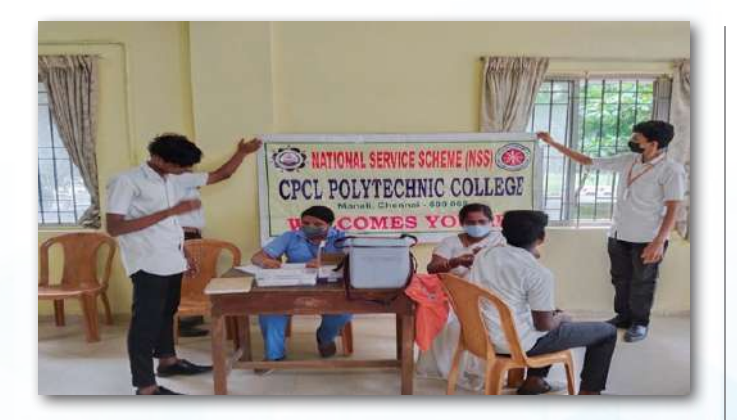
Safety and Life Skill Training