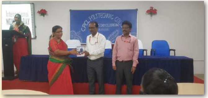
College. The programme was organized under NSS banner. The programme showed the upliftment of women in the society.