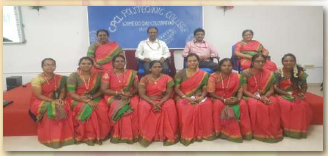
On 11th March 2022, International Women's Day was celebrated by the staff members of CPCL Polytechnic